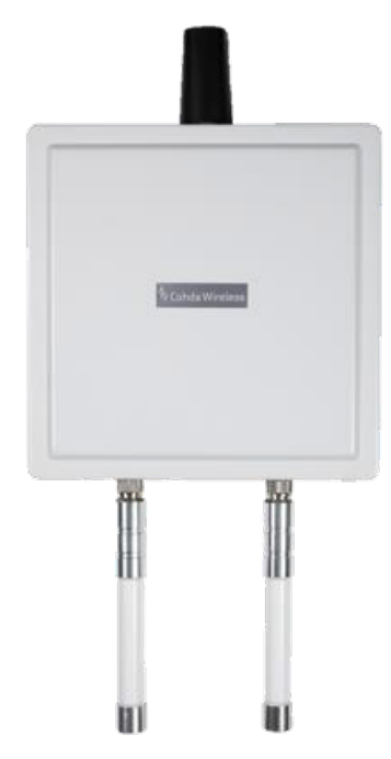
The MK6C is an EVK and no regional regulatory compliance (FCC, CE, etc.) is available.

Cohda Wireless Pty Ltd 27 Greenhill Road Wayville SA 5034 Australia P +61 8 7099 5500 inquiry@cohdawireless.com